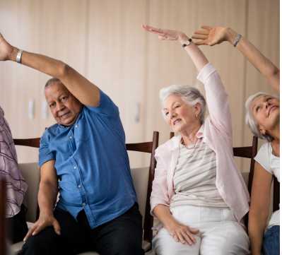
Exercise & Relaxation Sessions Every Mon 10am-11am

£12.50 per session PLEASE BRING A TOWEL or pay a £2.50 charge