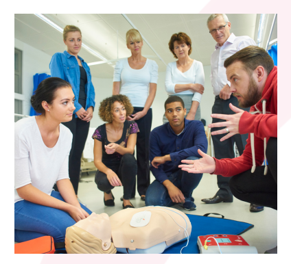
First Aid Training Tues 18th Mar 2025 10:30am to-12pm or Tues 17th Jun 2025 10:30am to-12pm

Learn basic first aid skills from The British Red Cross experts. Choose one of the above dates.