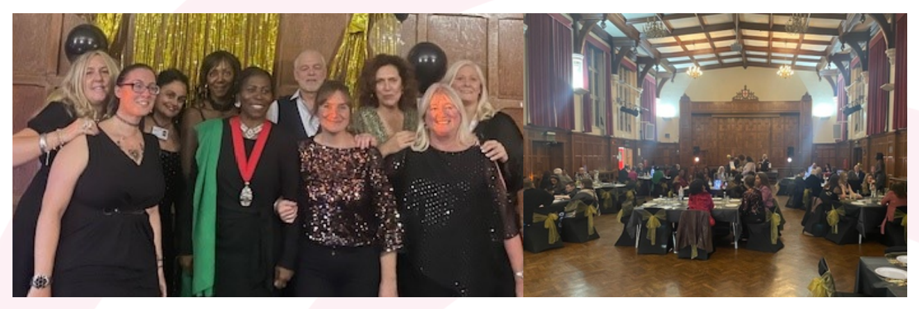
Glitz & Glam - The most glamorous Autumn event of 2024!

Carers enjoyed a hot meal, live entertainment and dancing (or watching others do so!) at our Annual Glitz and Glam event last October. Set a reminder now to buy your tickets early for this October.